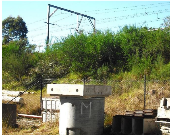
Broom, transport corridor, Lawson, Blue Mountains 2024

matter that it has referred it to the Department of Primary Industry (NSW).