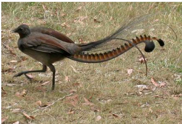
Superb Lyrebird.