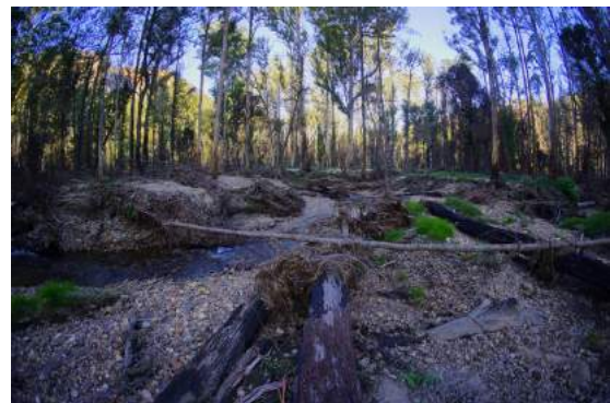
The Grose River North Bank at Blue Gum Forest is undercut with sand and gravel deposits which fill a formerly deep swimming hole. River stones are covered in fine silt and there are few aquatic animals.