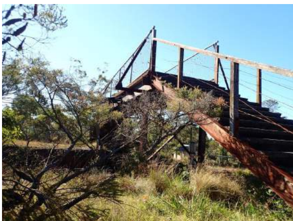
Bridge between Memorial Park and Wilson Glen – red bunting lingers from the “Save the bridge campaign”.