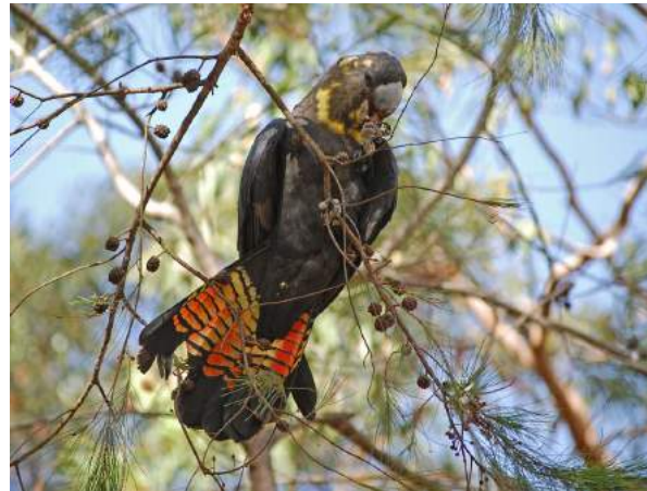
The Glossy Black Cockatoo.