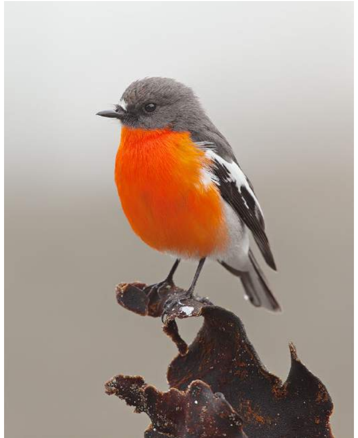
Above. Flame robin

Over the summer of 2019-20, airborne embers created spot fires near the lake and rain storms washed away some of the walking paths and causeways. Nevertheless, the reserve is still accessible to visitors and the birdlife remains present.