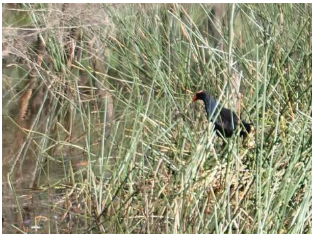
Below. A swamp hen at Lake Pillans