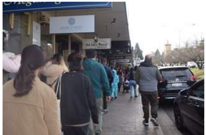
Leura Mall on June 7, Queen's birthday long weekend

The subcommittee welcomes feedback from interested members.