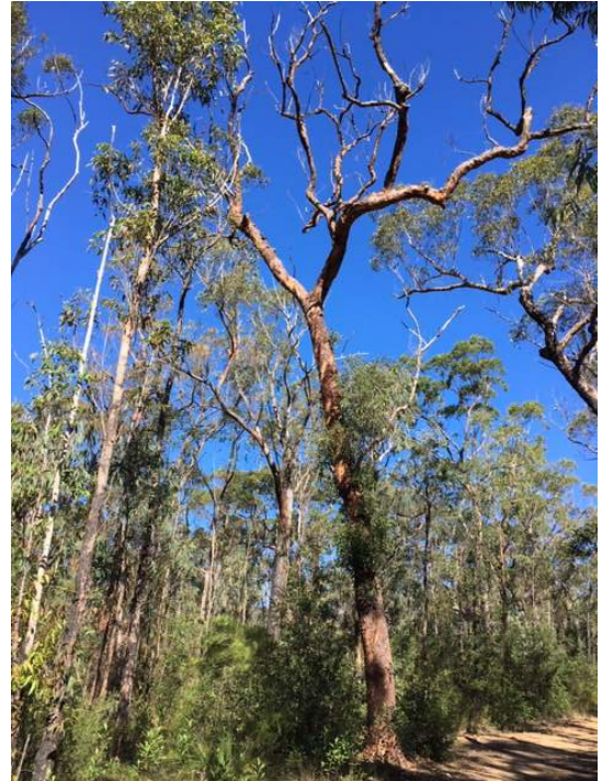
Sydney Red Gum, Angophora costata