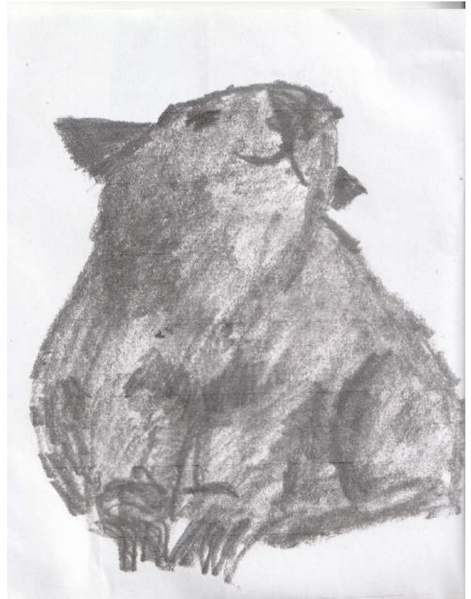
Drawing by Anna Culliton

It is a strong call for nature conservation and protection in a more optimistic era and is well worth