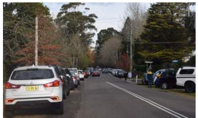
Falls Road, Wentworth Falls on June 7, the Queen's birthday long weekend