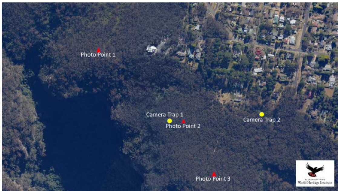
Figure 1 – Flora and fauna monitoring sites

The three photo points are all in dry sclerophyll forest communities on ridge lines. We've added to the flora sites to include examples of hanging swamp, temperate rain forest and Blue Mountains heath plant communities. Rob Smith and Jan Allen both previously botanists at the Blue Mountains Botanic Garden at Mount Tomah and Wyn Jones, formerly an ecologist with National Parks and Wildlife Service (NPWS) assisted with these additions.