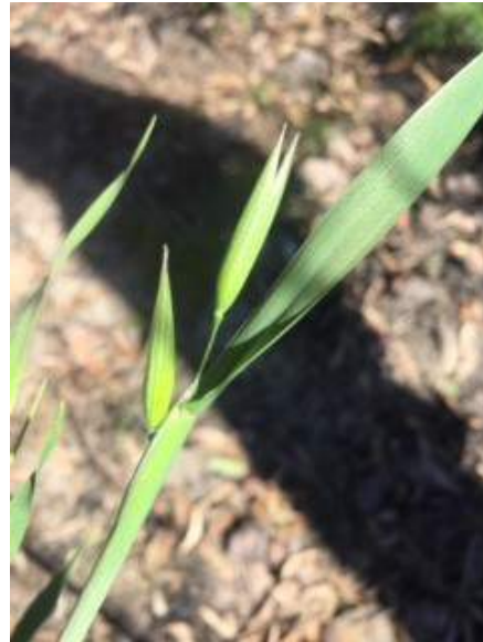
Above: An oat seedling is not a native and should be removed.