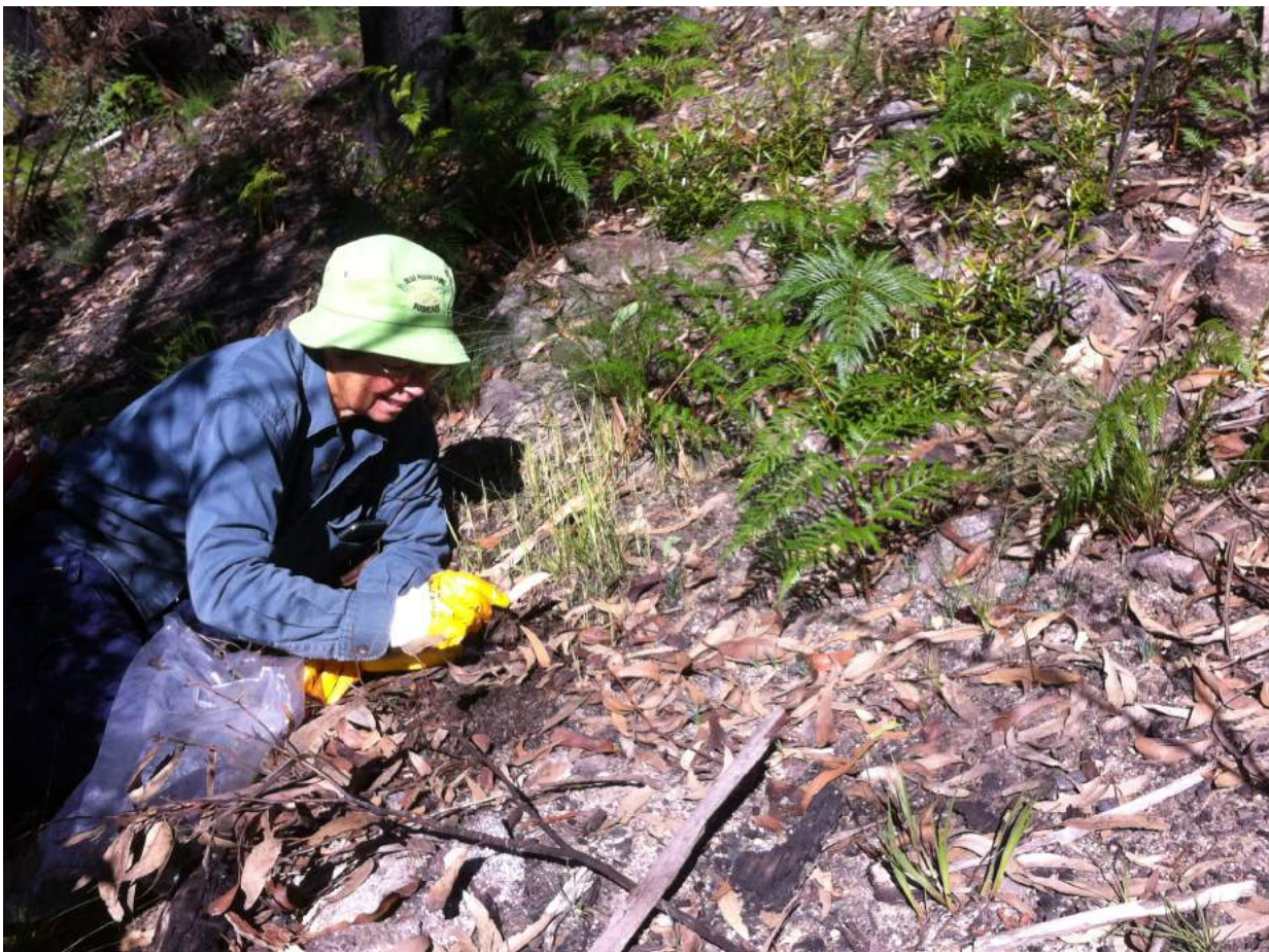
Below: Lesley removes weed seedlings from a former feeding station