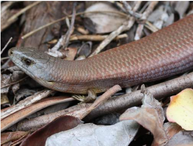
A mainland she-oak skink.