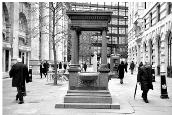
Photo: Tide turns: The Maternité drinking fountain in Royal Exchange. London is planning to install new fountains and is looking for funding to restore existing historic ones

annually pass through the two sites, the scheme will be extended to underground, bus and railway stations across London and the south-east before the 2012 Olympics.